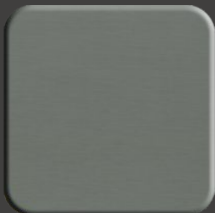
larson metals* Zinc Green larcore* A2 & elZinc* Zinc Green