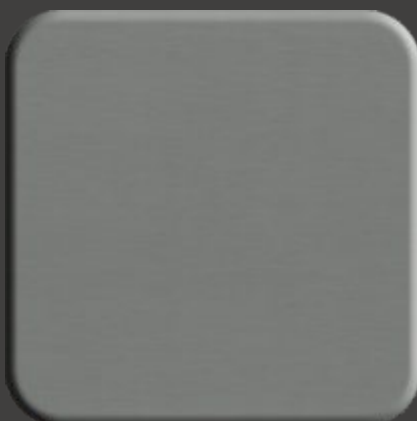
larson metals* Zinc Slate larcore* A2 & elZinc* Zinc Slate