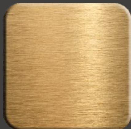
larson metals* Copper