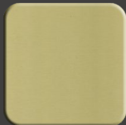
larson metals* Zinc Gold larcore* A2 & elZinc* Zinc Gold