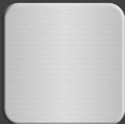
larson metals* Stainless Steel 2D