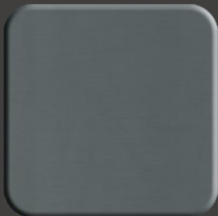
larson metals* Zinc Blue larcore* A2 & elZinc* Zinc Blue

Noble metals such as Stainless Steel, Copper, Brass and Zinc are shown in their natural appearance. The lack of treatment makes these composites the ideal ecological solution and provides the sensation of liveliness from the distinctive nature's finest elements. Lightness and flatness Alucoil's panels.