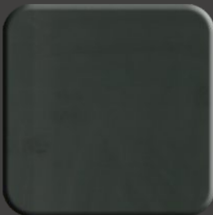
larson metals* Zinc Ebano larcore* A2 & elZinc* Zinc Ebano