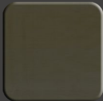
larson metals* Zinc Brown larcore* A2 & elZinc* Zinc Brown