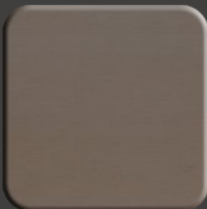
larson metals* Zinc Red larcore* A2 & elZinc* Zinc Red