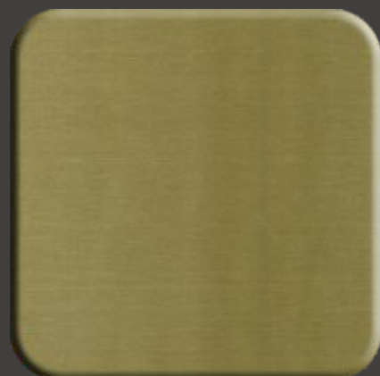
larson metals* Brass