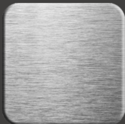
larson metals* Stainless Steel WF30 Brushed